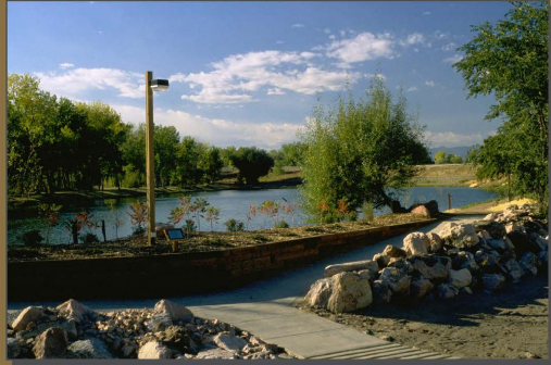
Willow Springs Ponds

Park Hours: 5 a.m. to 11 p.m. Reservation season: April – October