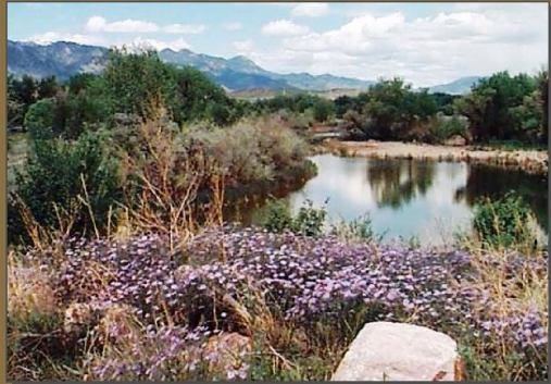
Cattail Marsh Wildlife Area