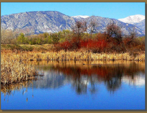
Cattail Marsh Wildlife Area