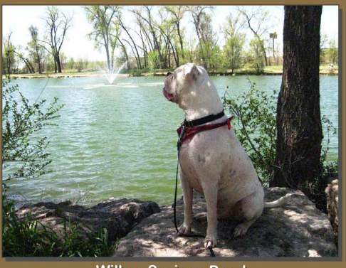
Willow Springs Pond