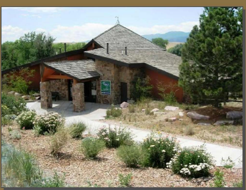
Fountain Creek Nature Center