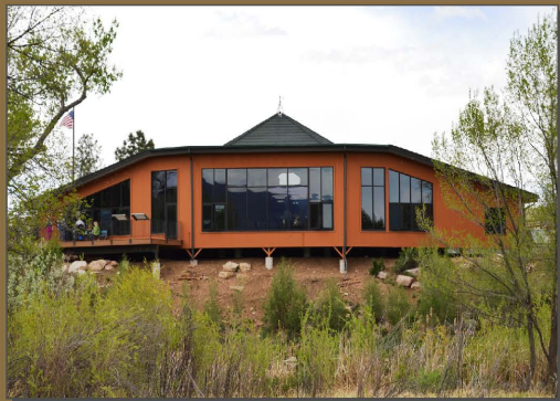
Fountain Creek Nature Center