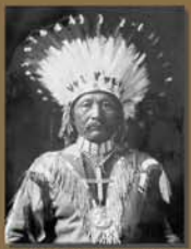
Chief Buckskin Charlie