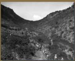
Rattlesnake Gulch 1912 Dedication Ride (Pikes Peak Library Dist)