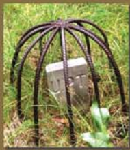
1912 Ute Indian Trail Marker (El Paso County Parks)