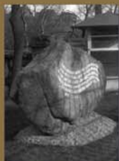
Ute Indian Trail Marker in Manitou Springs