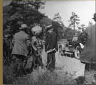
Chief Buckskin Charlie and Governor Adams 1912 Dedication Ride (Pikes Peak Library Dist)