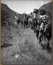
Rattlesnake Gulch 1912 Dedication Ride (Pikes Peak Library Dist)

The Ute Indian Trail is one of the oldest migratory routes in the United States, its use dating back to 10,000 years ago. Ute people used the trail to access rich hunting grounds in South Park, trade with other tribes, and for spiritual pilgrimages to the sacred Manitou springs, where the breath of the "Great Spirit" created bubbles and bestowed them with curing powers.